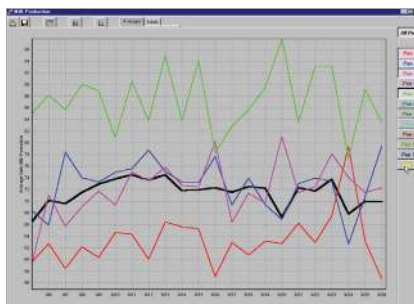
Example Parlor Watch Reports and Graphs