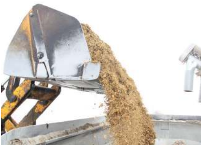
Simple yet precise feeding software