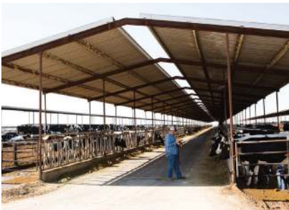
Reliable system to feed your most valued assets