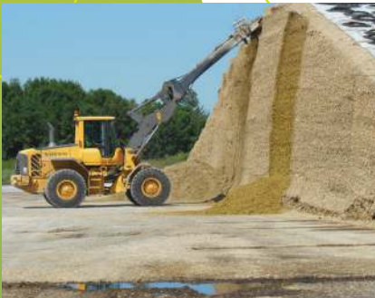
Easily measure shrink and track inventories