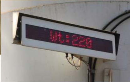
Super bright external LED display; visible in full sunlight